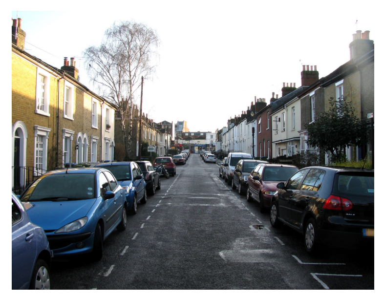
Fig 14 Amoy Street public car park Fig 15. Canton Street