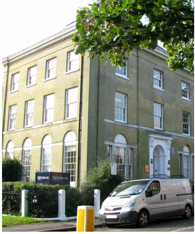
Fig 21 St Anne's Catholic School