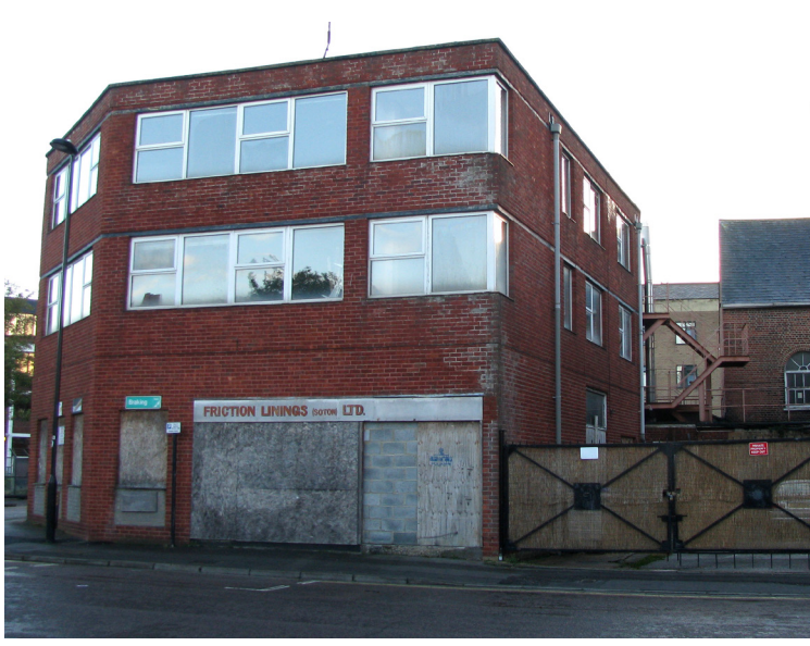
Fig 19 Handford Place & Upper Banister Street Fig 20 Handford Place