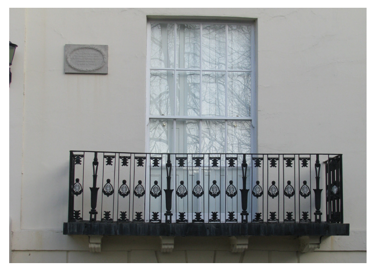
Fig 25 Example of railings Fig 26 Example of window and balcony