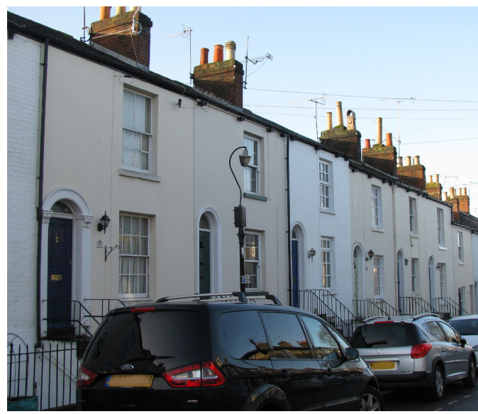
Fig 16. 33 & 35 Canton St Fig 17. South side of Canton Street