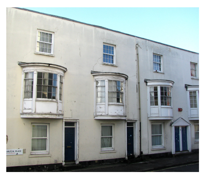
Fig 27 Terrace in Carlton Place

The part of Henstead Road within the Conservation Area is characterised by two and three storey terraced Regency-style town houses. The terrace on the south side is Grade II listed.