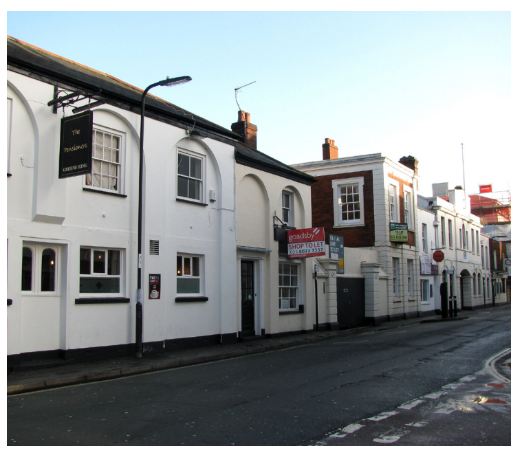
Fig 28 North side of Carlton Place