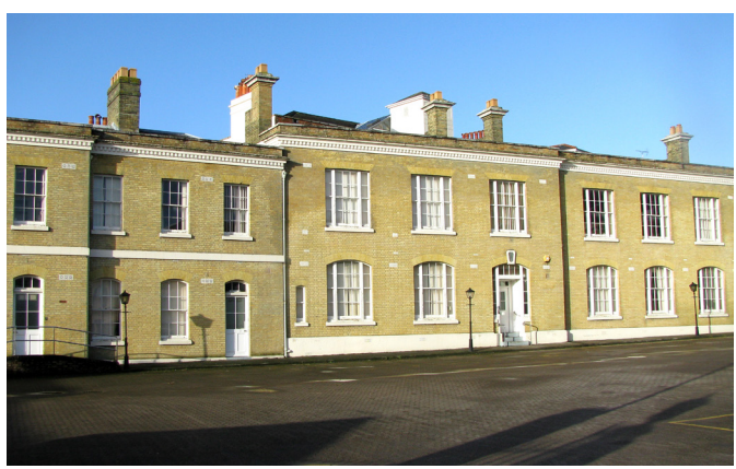
Fig. 3 Where Wilton Road meets Bedford Place Fig. 4 Barrack buildings