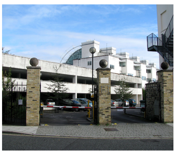
Fig 17. South side of Canton Street Fig 18 Courts complex