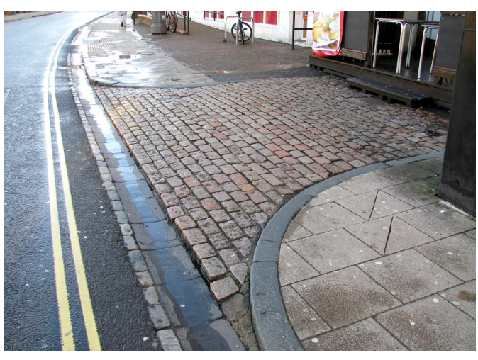
Fig 30 Pavement crossover and black gutter gullies