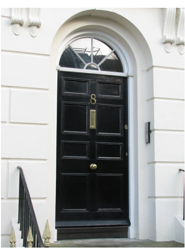
Fig 23 Court building Fig 24 Example of front door