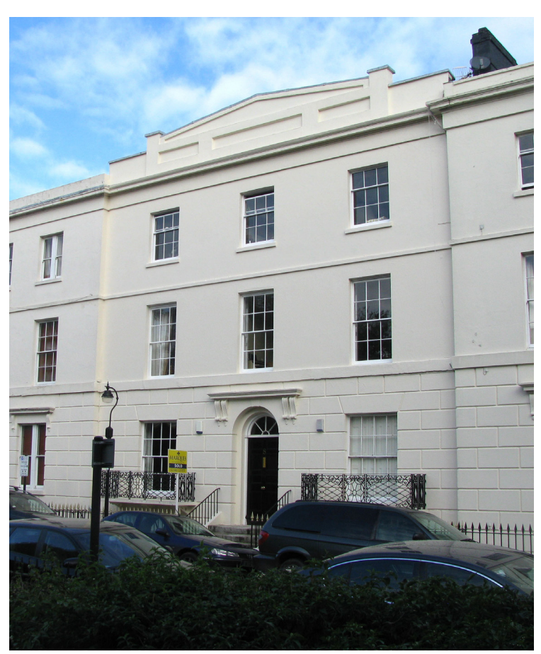
Fig 6 Rockstone Place

The half acre opposite the houses in Rockstone Place and backing on to the already developed Carlton Crescent was left as an amenity for the residents of Rockstone Place and laid out as a small pleasure garden with railings. In 1879 the surviving heirs of Samuel Toomer gifted the garden to Southampton Borough Council to be kept as an open area in perpetuity. 3