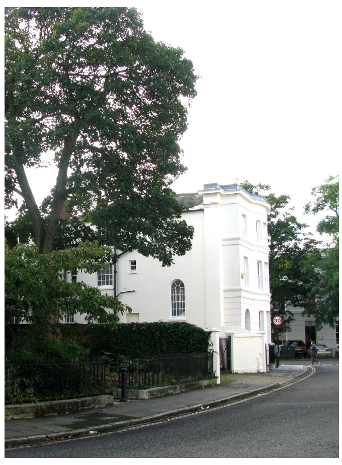
Fig 7 Little Mongers Park